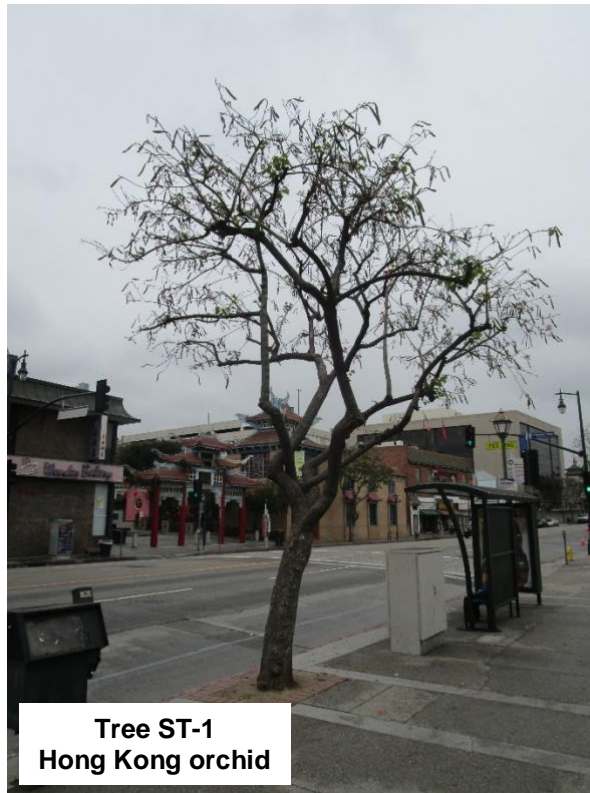
Tree ST-1 Hong Kong orchid