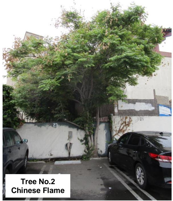
Tree No.2 Chinese Flame