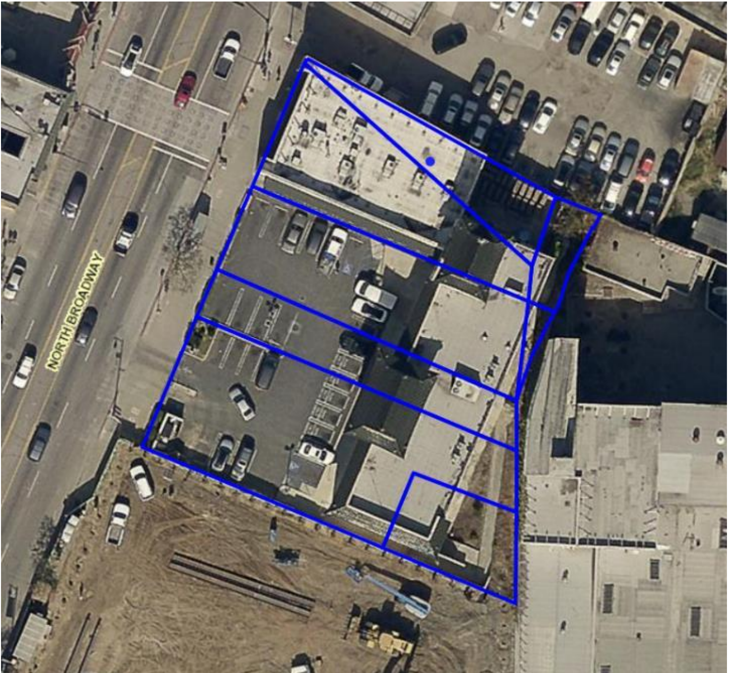
Aerial image of subject properties at 942 N. Broadway, Los Angeles