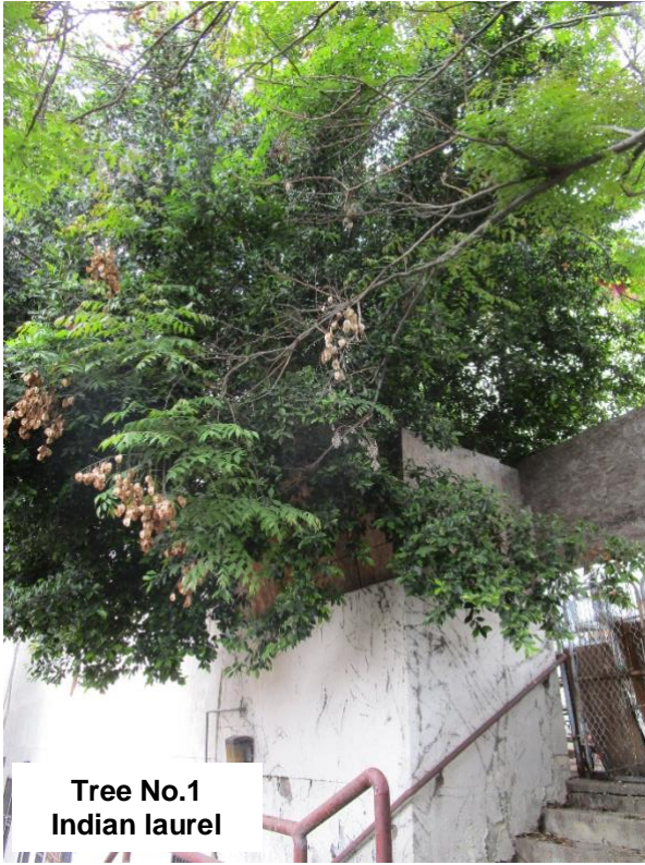
Tree No.1 Indian laurel